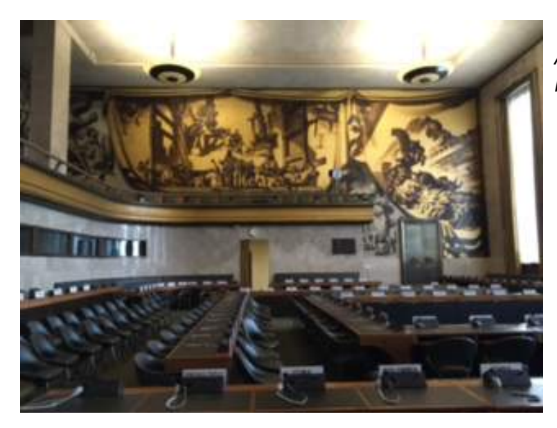
Assembly Hall Palais des Nations